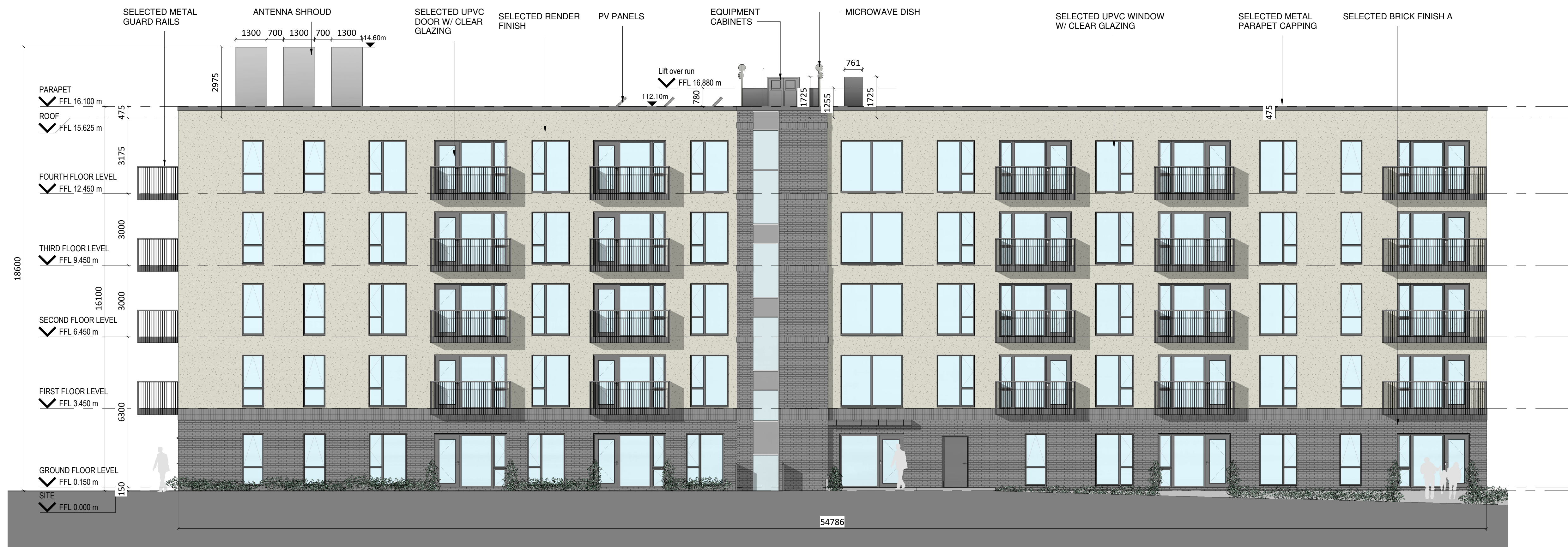
1 BLOCK B - EAST ELEVATION 1 : 100