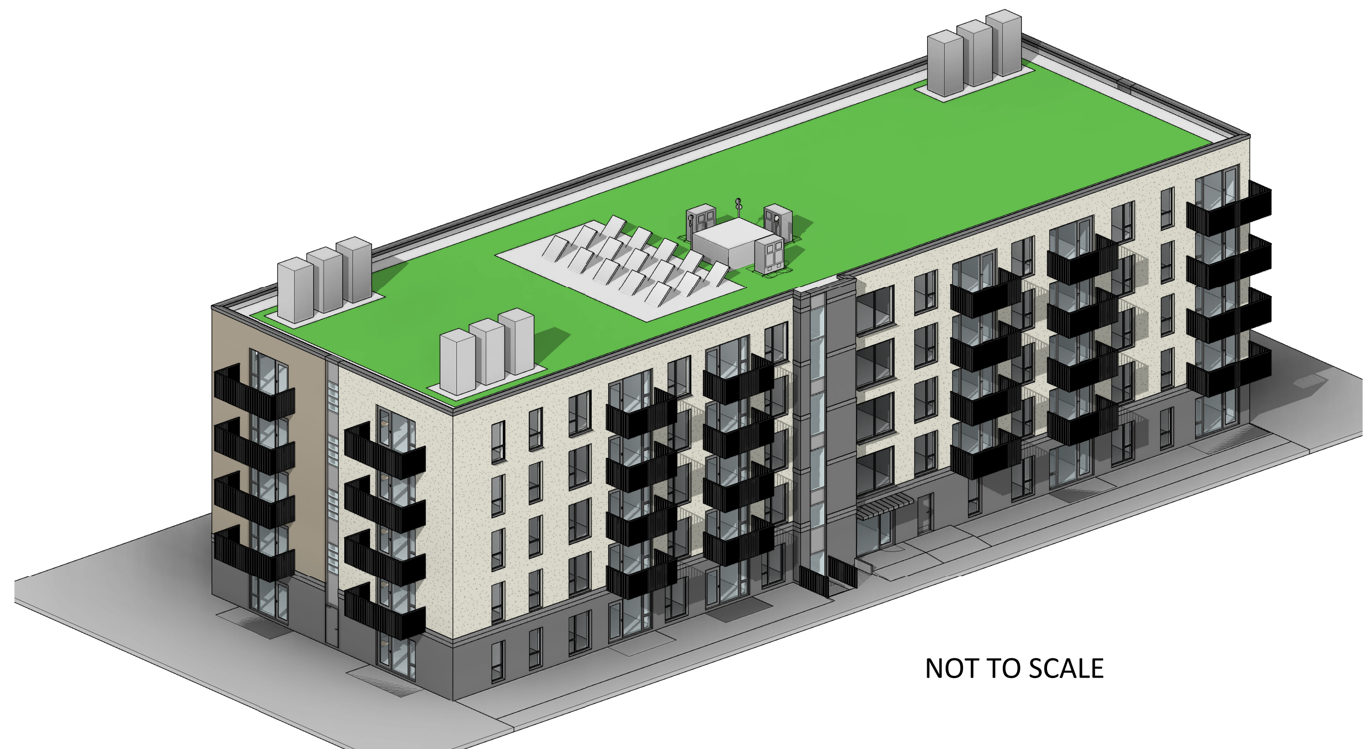
3 APARTMENT B - 3D VIEW B