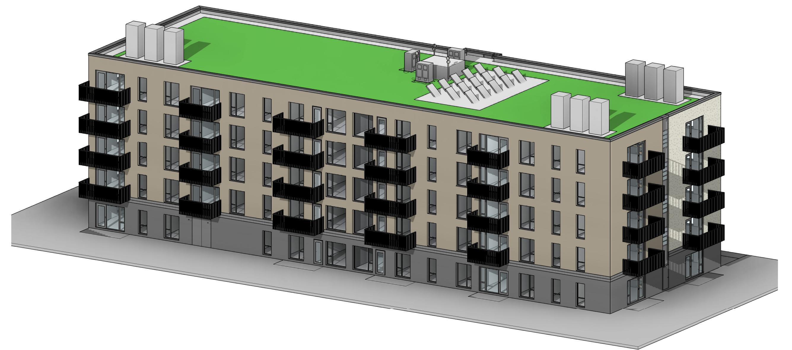
2 APARTMENT B - 3D VIEW A